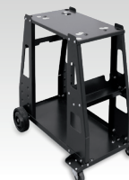
PLASMA 600 trolley 040298