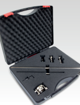
Compass kit 040205